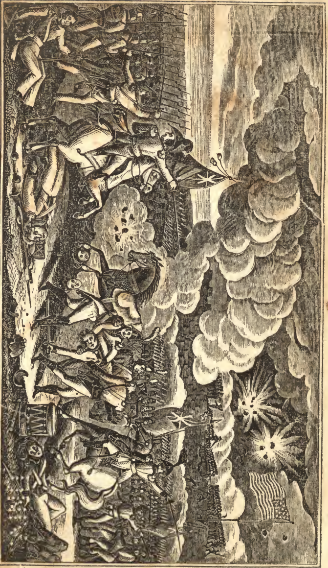
BATTLE OF NEW ORLEANS.....GENERAL JACKSON.